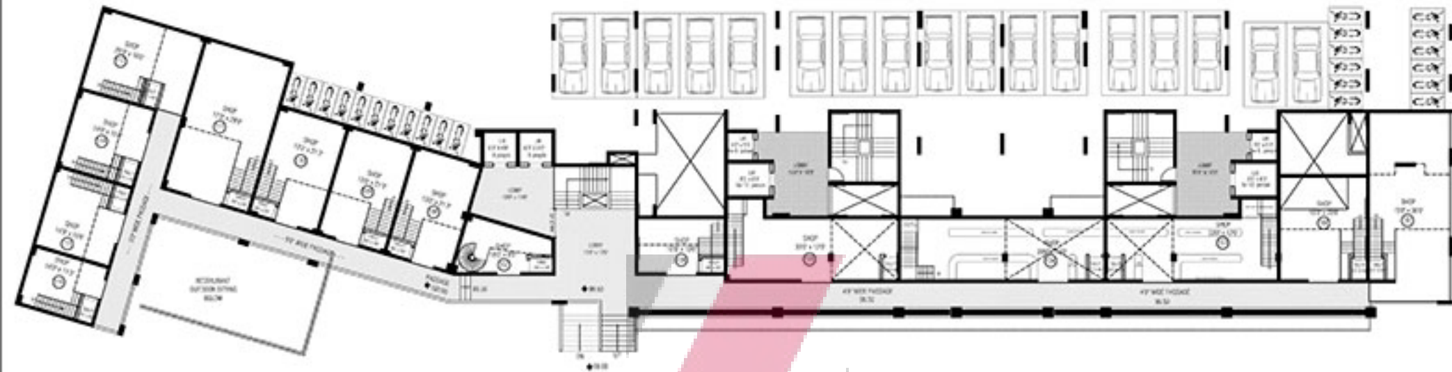
UPPER GROUND FLOOR PLAN