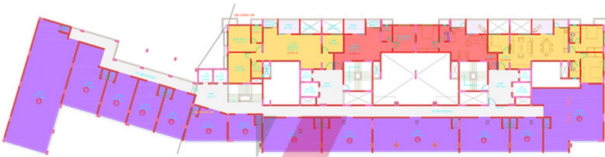
SECOND FLOOR PLAN SALABLE AREA STATEMENT FOR SHOPS (in sq. ft.)